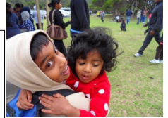
Toddler dared the weather