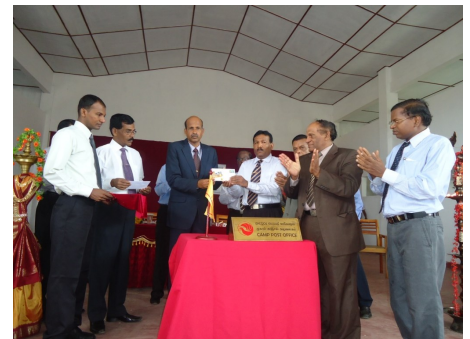
Commemoration Stamp Released

tions or tournaments. The prizes were given away on the final day, the 13th July 2013. The competitions included essay writing, poetry, spell master chess, cricket and volley ball