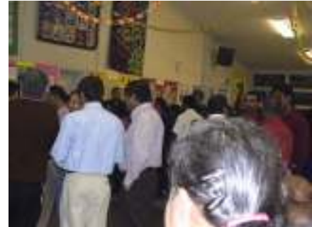
People around the hopper pans